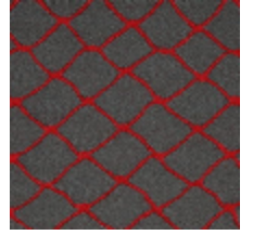
3436-07 CABARET - LAQUE *