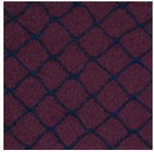
3436-08 CABARET - NECTAR *