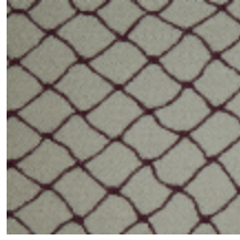
3436-03 CABARET - BORDEAUX *