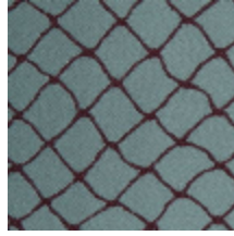
3436-04 CABARET - PORCELAINE *