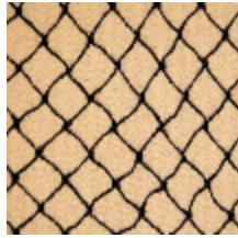
3436-10 CABARET - CHAIR *