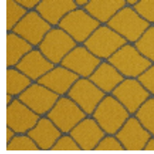
3436-06 CABARET - POLLEN *