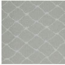
3436-09 CABARET - BEIGE *