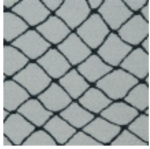
3436-01 CABARET - GRAPHITE *