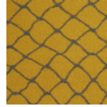
3436-06 CABARET - POLLEN *