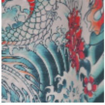
3438-01 ROCK - BENGALÉ