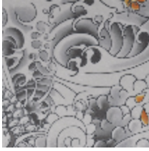
3438-02 ROCK - GOLD