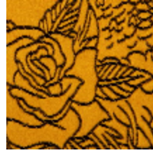
3440-06 SKIN - GOLD