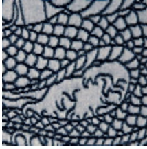
3440-02 SKIN - ENCRE