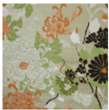
3466-01 KYOTO - TAUPE