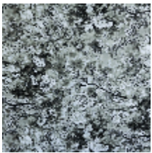
3468-01 SAKURA - NATUREL