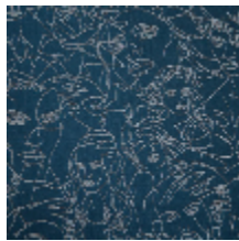
3471-05 REGARD - BLEU *