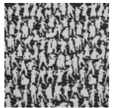
3492-06 SILHOUETTES - NOIR