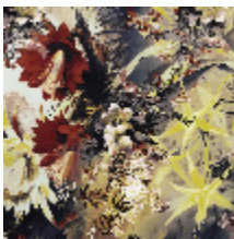
3497-02 FLOWER POWER – MORDORE

lelievrepairs.com contact@lelievrepairs.com