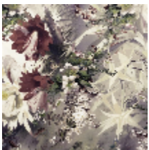
3497-01 FLOWER POWER – PASTEL