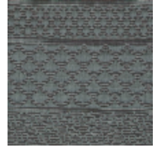
3614-06 PATCHWORK - ACQUA