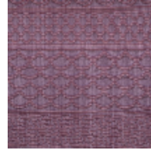
3614-05 PATCHWORK - LILAS