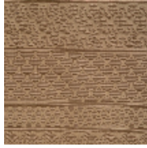
3614-03 PATCHWORK - CAMEL