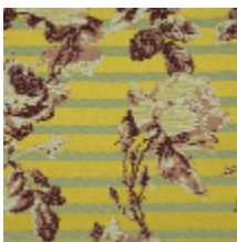
3615-02 CROISIÈRE - BERGAMOTE