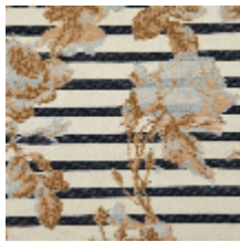
3615-01 CROISIÈRE - NATUREL