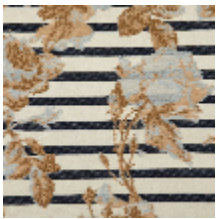
3615-01 CROISIÈRE - NATUREL