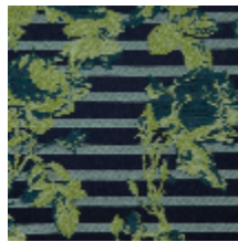
3615-04 CROISIÈRE - MARINE