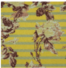
3615-02 CROISIÈRE - BERGAMOTE