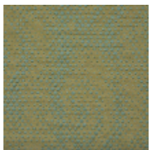
3619-01 TROIS D - BERGAMOTTE