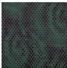
3619-02 TROIS D - ACQUA/PRUNE