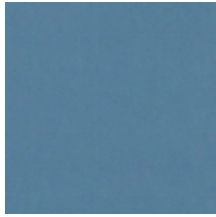
0383-08 COSMOS - NATTIER