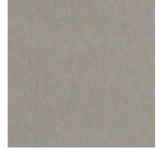
0383-06 COSMOS - SILEX