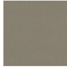
0383-11 COSMOS - TAUPE