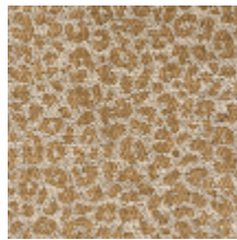
4031-04 FAUVE - OR