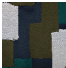
4033-04 ABSTRACT - VERT MARINE