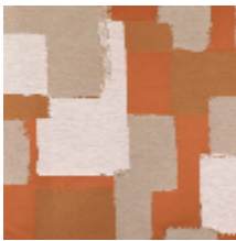
4033-02 ABSTRACT - TERRA NATUREL