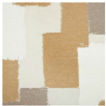
4033-01 ABSTRACT - BLANC SABLE