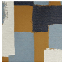
4033-03 ABSTRACT - OR BLEU