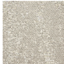
4236-05 ANTICA MI - QUARTZ