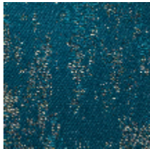
4236-01 ANTICA MI - LAPIS