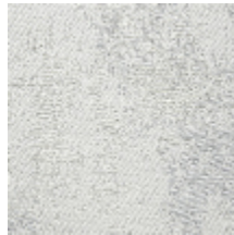
4236-04 ANTICA MI - ALBATRE