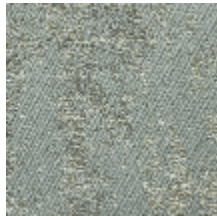
4236-03 ANTICA MI - CALCEDOINE