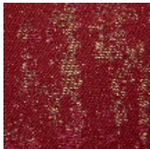
4236-07 ANTICA MI - GRENAT