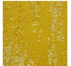
4236-06 ANTICA MI - SOUFRE