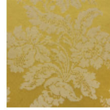
4237-05 VILLARCEAUX - OR