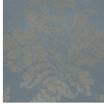
4237-03 VILLARCEAUX - POMPADOUR