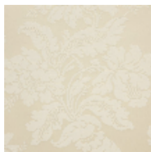
4237-01 VILLARCEAUX - IVOIRE