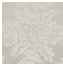
4237-02 VILLARCEAUX - ARGENT