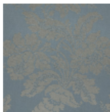
4237-03 VILLARCEAUX - POMPADOUR