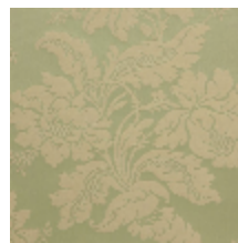
4237-06 VILLARCEAUX - AMANDE