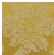
4237-05 VILLARCEAUX - OR