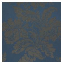
4237-04 VILLARCEAUX - NUIT