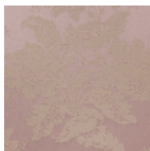
4237-07 VILLARCEAUX - POUDRE