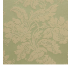
4237-06 VILLARCEAUX - AMANDE