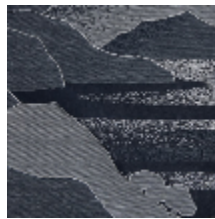
4238-04 CALANQUES - NUIT