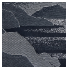
4238-04 CALANQUES - NUIT