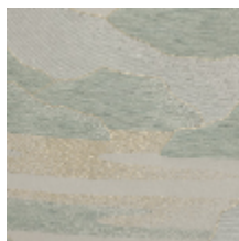
4238-03 CALANQUES - CELADON