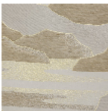
4238-02 CALANQUES - SABLE