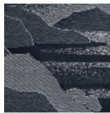
4238-04 CALANQUES - NUIT