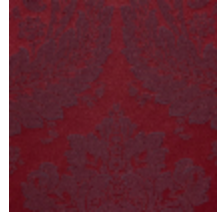
4240-05 VICTORIA M1 - RUBIS