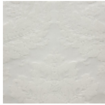
4240-09 VICTORIA M1 - IVOIRE