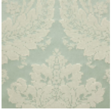
4240-01 VICTORIA M1 - CELADON