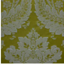
4240-02 VICTORIA M1 - OLIVE