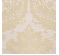
4240-06 VICTORIA M1 - POUDRE