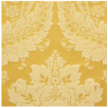
4240-07 VICTORIA M1 - OR