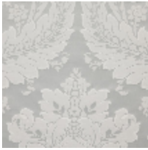
4240-08 VICTORIA M1 - ARGENT