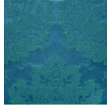
4240-03 VICTORIA M1 - CANARD