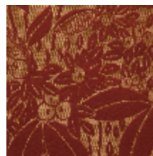
4241-05 VETIVER - EPICE