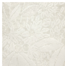
4241-04 VETIVER - JASMIN