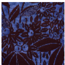
4241-01 VETIVER - IRIS