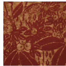
4241-05 VETIVER - EPICE