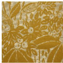
4241-03 VETIVER - BERGAMOTE