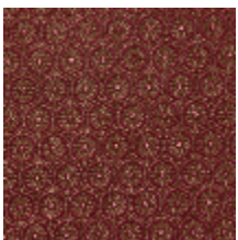
4243-01 MEDAILLON - CRAMOISI