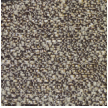
4246-01 ORÉE - LIEGE