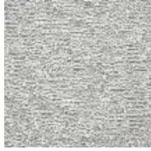
4246-03 ORÉE - PERLE