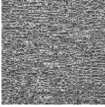
4246-02 ORÉE - GRANIT