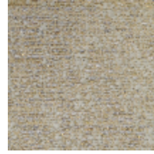
4246-05 ORÉE - GRES