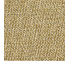
4248-06 DIAMANT M1 - OR