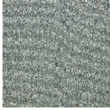
4251-02 KATMANDOU - EUCALYPTUS