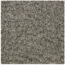
4251-07 KATMANDOU - LIEGE