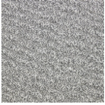
4251-01 KATMANDOU - GRANIT