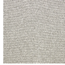
4251-05 KATMANDOU - FICELLE