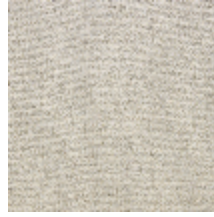
4251-04 KATMANDOU - NATUREL