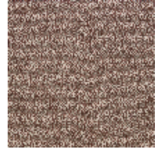
4251-06 KATMANDOU - TOMETTE