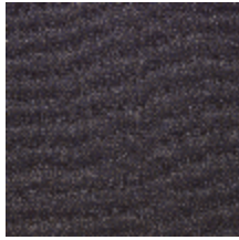
4251-08 KATMANDOU - AUBERGINE