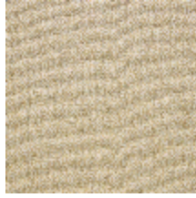
4251-03 KATMANDOU - GENÊT