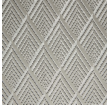
4256-02 ARIANE M1 - NATUREL