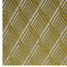
4256-03 ARIANE M1 - ABSINTHE