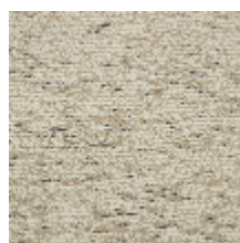
4259-03 BALTIC - SABLE