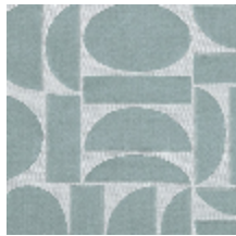
4260-03 FJORD - CELADON