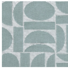
4260-03 FJORD - CELADON