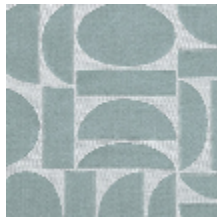
4260-03 FJORD - CELADON