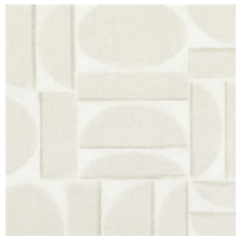
4260-01 FJORD - ECRU