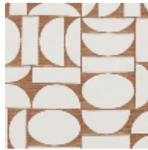
4260-04 FJORD - COGNAC