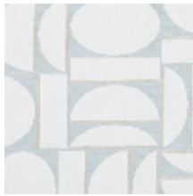
4260-02 FJORD - GLACIER