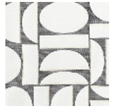
4260-06 FJORD - POIVRE