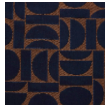
4260-05 FJORD - ENCRE