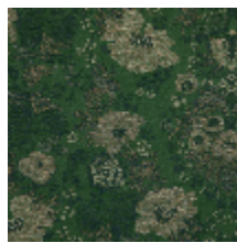
4261-04 FELICITÉ - BUIS