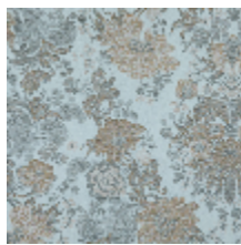
4261-03 FELICITÉ - NATTIER