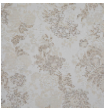
4261-02 FELICITÉ - NACRE