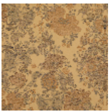
4261-01 FELICITÉ - DORÉ