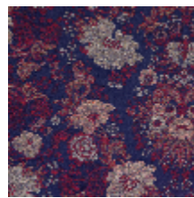
4261-05 FELICITÉ - ENCRE