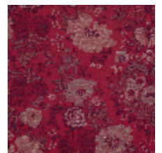
4261-06 FELICITÉ - GRIOTTE