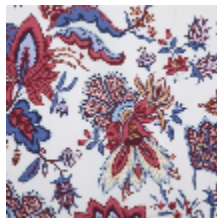
4266-03 EGLANTINE - GRIOTTE