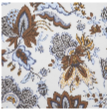
4266-01 EGLANTINE - NATUREL