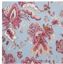
4266-04 EGLANTINE - BOUDOIR