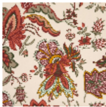
4266-02 EGLANTINE - PRINTEMPS