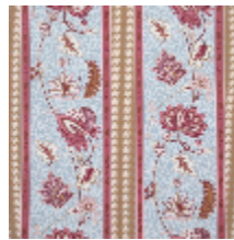
4267-04 AUGUSTINE - BOUDOIR