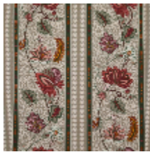
4267-02 AUGUSTINE - PRINTEMPS