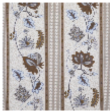
4267-01 AUGUSTINE - NATUREL