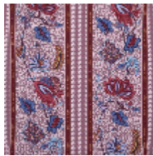
4267-03 AUGUSTINE - GRIOTTE