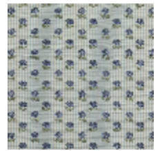
4283-06 EXQUISE - NATTIER