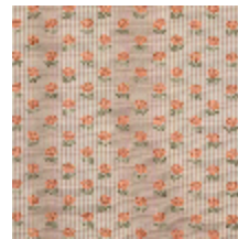
4283-05 EXQUISE - CAPUCINE