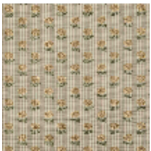
4283-01 EXQUISE - BEIGE