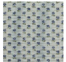
4283-06 EXQUISE - NATTIER