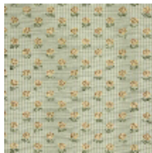
4283-03 EXQUISE - AMANDE