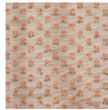
4283-05 EXQUISE - CAPUCINE