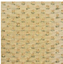
4283-02 EXQUISE - DORE