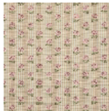
4283-04 EXQUISE - PETALE