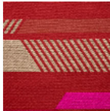
0563-03 GAUCHO - ATLAS *