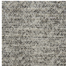
0564-03 LANDE - BREST