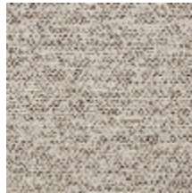
0564-04 LANDE - IBIZA