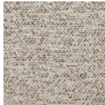
0564-04 LANDE - IBIZA