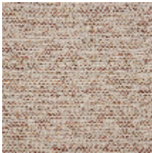
0564-02 LANDE - PIANA