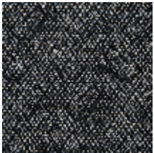
0564-01 LANDE - INDIGO