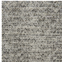
0564-03 LANDE - BREST