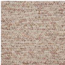
0564-02 LANDE - PIANA