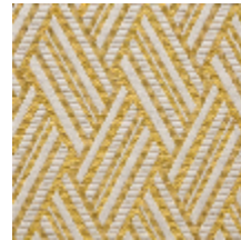
0568-08 VACO A - SOLEIL *