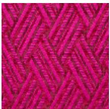
0568-10 VACO A - FUCHSIA *