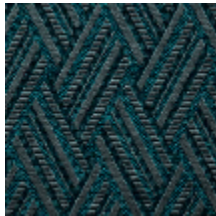
0568-03 VACO A - CANARD *