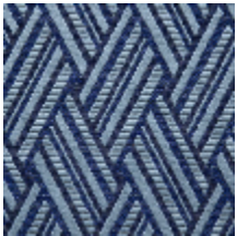
0568-02 VACO A - NAUTIQUE *