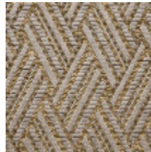
0568-07 VACO A - BRONZE *