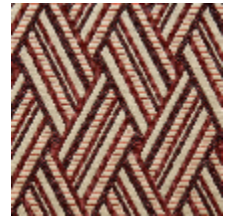
0568-09 VACO A - TOMETTE *