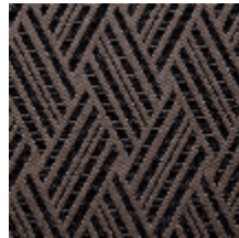
0568-04 VACO A - FUSAIN *