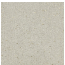
0571-01 CAMARGUE - CHAUX