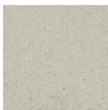
0571-01 CAMARGUE - CHAUX