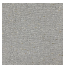
0571-02 CAMARGUE - BRUME