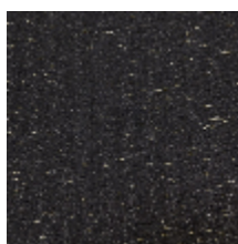
0571-03 CAMARGUE - FUSAIN