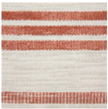
0573-01 MARINA - TERRACOTTA