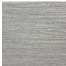
0575-03 RIVAGE - BRUME