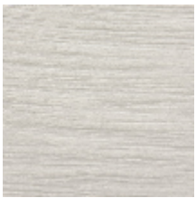
0575-01 RIVAGE - ECUME