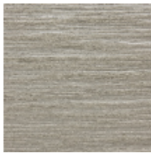
0575-02 RIVAGE - PIERRE