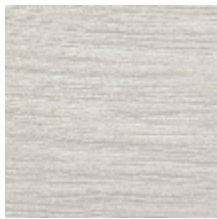
0575-01 RIVAGE - ECUME